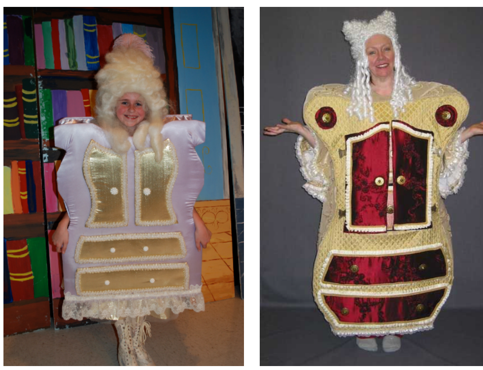
Servant Ensemble: We will be giving you a specific object you are. Must be able to transform into a servant wardrobe after the transformation.

Should have a dress on underneath to transform into at the end of show.